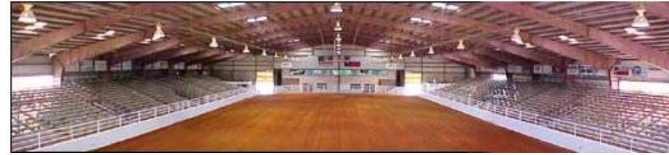
Nacogdoches, TX Expo Center